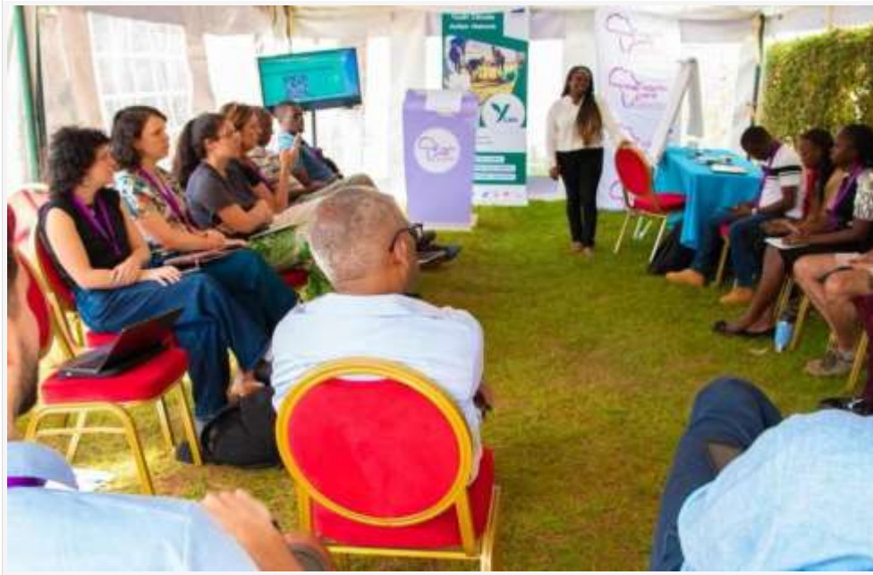
Stakeholder roundtables, community meetings, and convening sessions – Q1 2026.