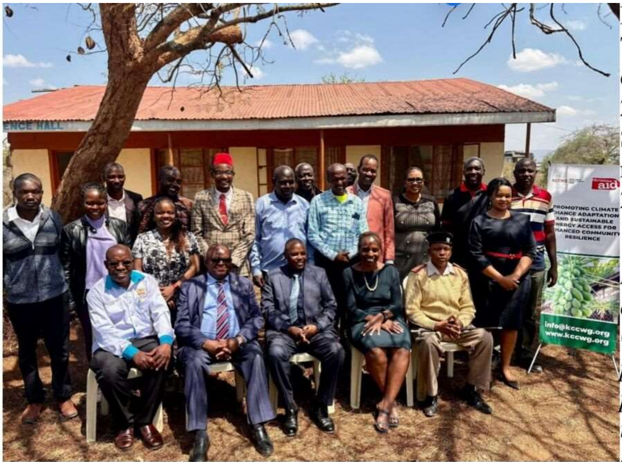
Above: CCASE project : Brainstorming session with the administrative ahead of the community dissemination session, Kajiado County.

KCCWG’s Climate Change and Sustainable Energy (CCASE) programme continued to demonstrate the transformative power of localized climate information services in Kajiado County. Through structured Participatory Scenario Planning (PSP), communities are now better equipped to navigate climate variability marking a critical shift from reactive coping to anticipatory, proactive climate management.