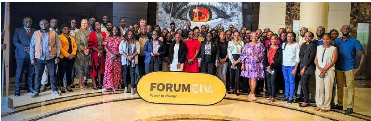
Post-COP30 Reflection Meeting participants, Nairobi.

Following the conclusion of COP30, KCCWG took part in the planning and participation of members on the convened Post-COP30 Reflection Meeting jointly hosted by CSOs. The forum brought together civil society actors across Kenya and other African countries to unpack the outcomes of global climate negotiations and assess their implications for national and sub-national advocacy efforts.