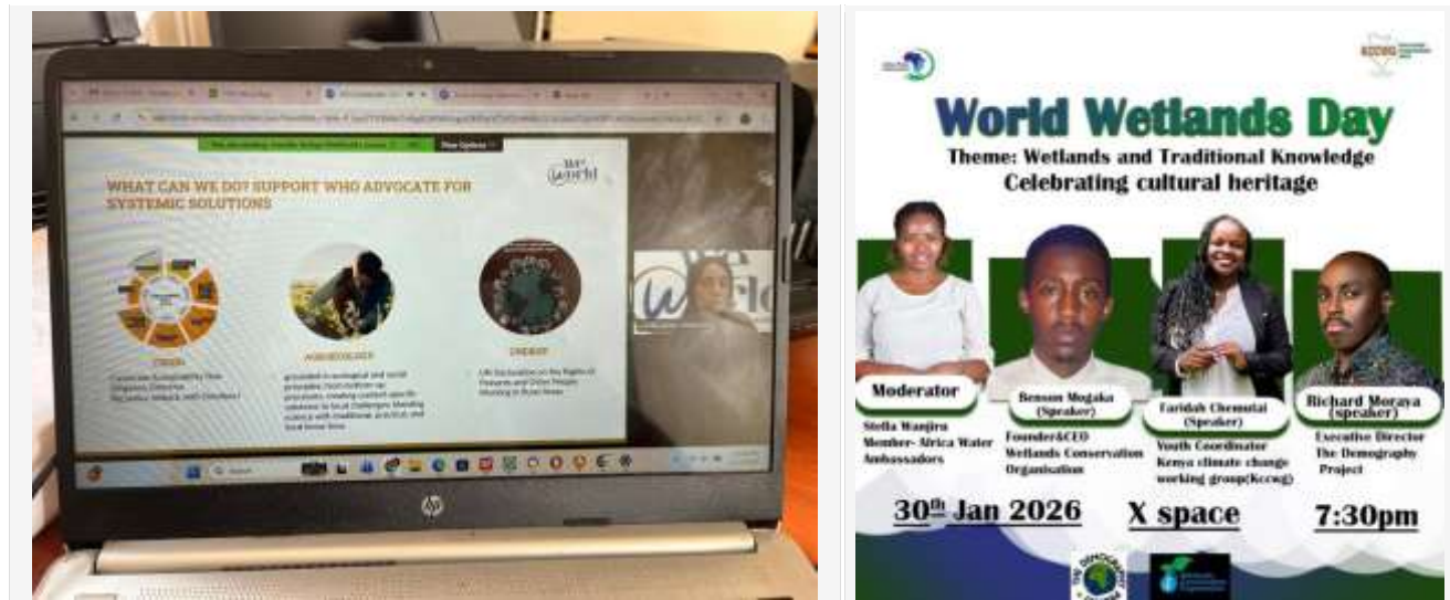
Social media content creation and digital campaign materials from Q1 2026.