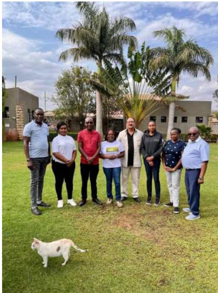
KCCWG organizational structure.