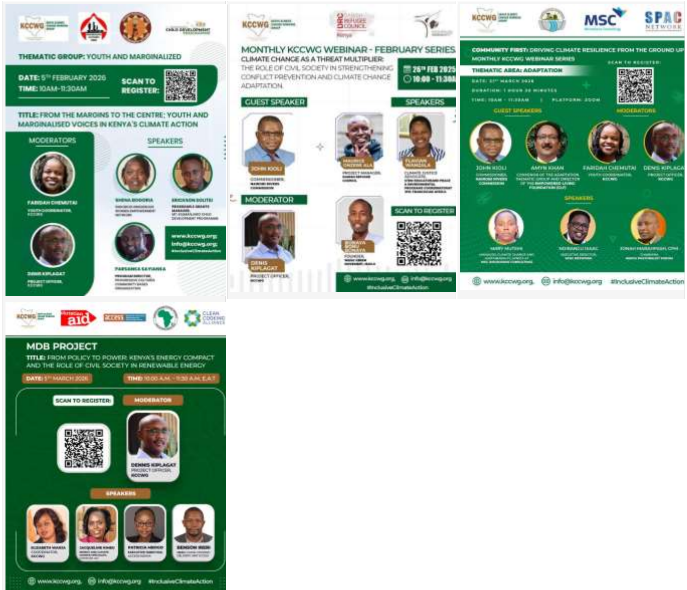
Climate Nexus Webinar Series – screenshots from webinar sessions Q1 2026.

KCCWG successfully delivered its Climate Nexus Webinar Series in Q1 2026, exploring critical intersections between climate change and other development sectors. The series served as a multi-stakeholder knowledge platform, bringing together experts, practitioners and community voices to advance integrated thinking on climate solutions.