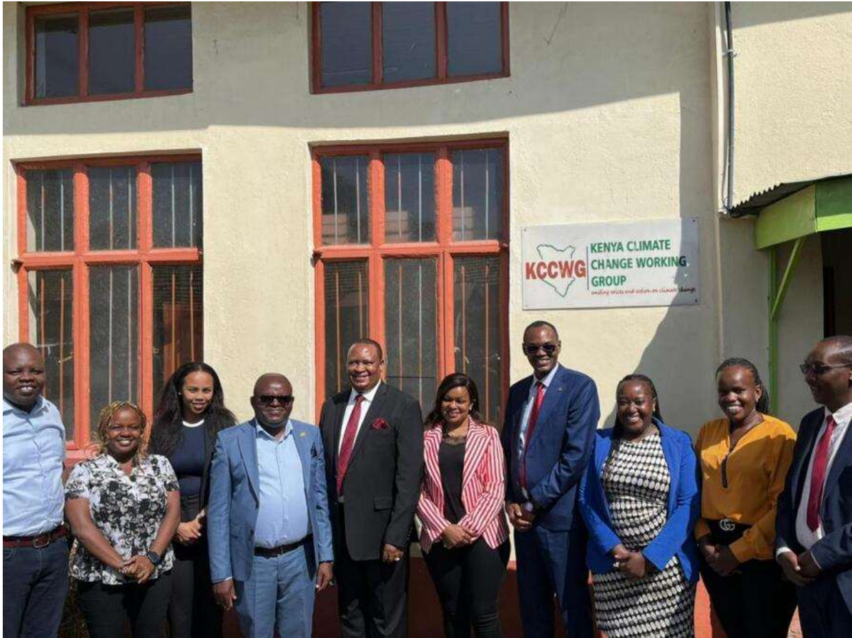
Partnership engagement and stakeholder collaboration session – Q1 2026.